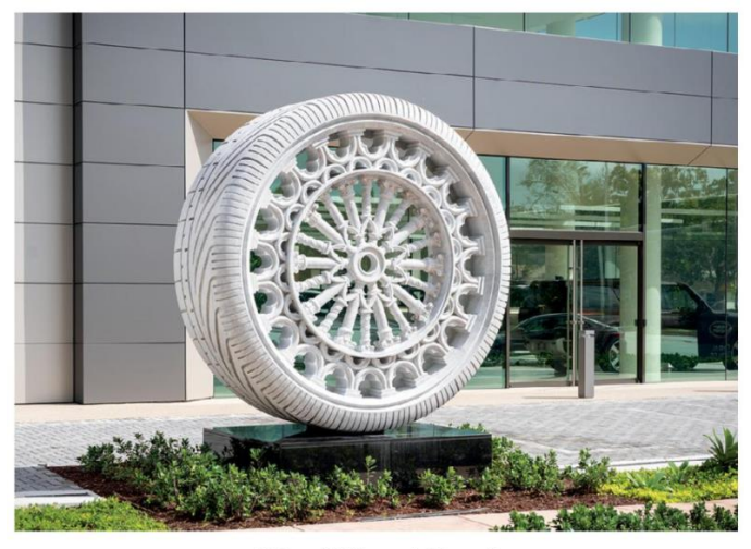
The Wheel Deal

Speaking of art in public places and Ponce de Leon Boulevard, you may have noticed a large white carved wheel outside the Jaguar Land Rover Coral Gables dealership at the intersection of Ponce and US-1. This is no ordinary wheel, but a six-ton Carrara marble